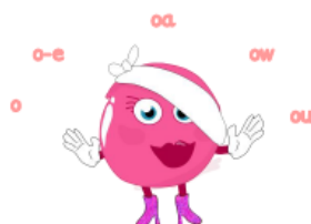
Miss Oh No