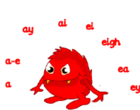
Angry Red A