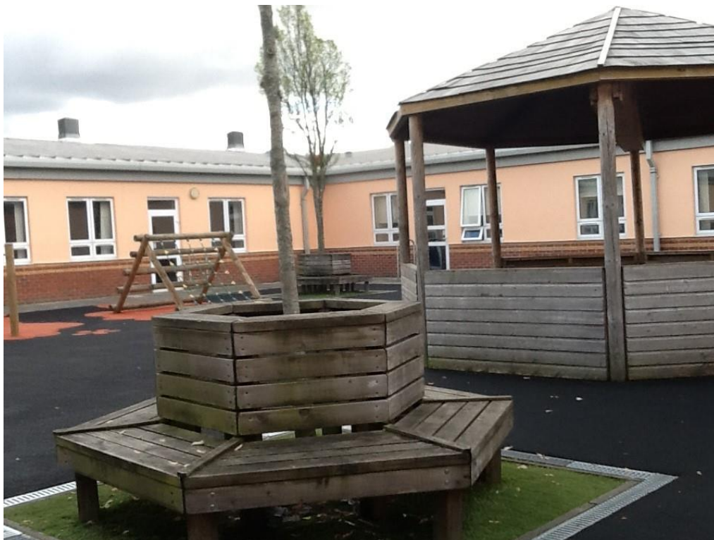
Our Light room